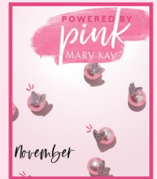
Who will be next?